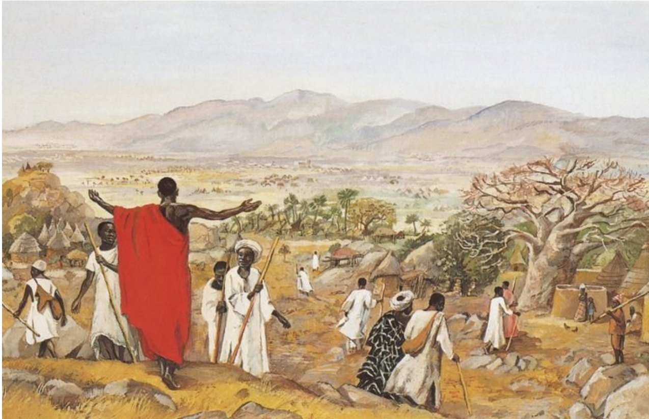
JESUS MAFA. The mission to the world, from Art in the Christian Tradition , a project of the Vanderbilt Divinity Library, Nashville, TN. https://digilib.library.vanderbilt.edu/act-imageLink.php?RC=48314 [retrieved December 28, 2023]. Original source: http://www.librairie-emmanuel.fr/contact .