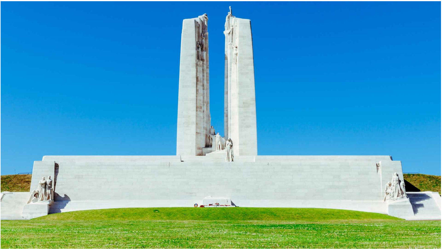
Canadian National Vimy Memorial, Givenchy-en-Gohelle, Hauts-de-France, France