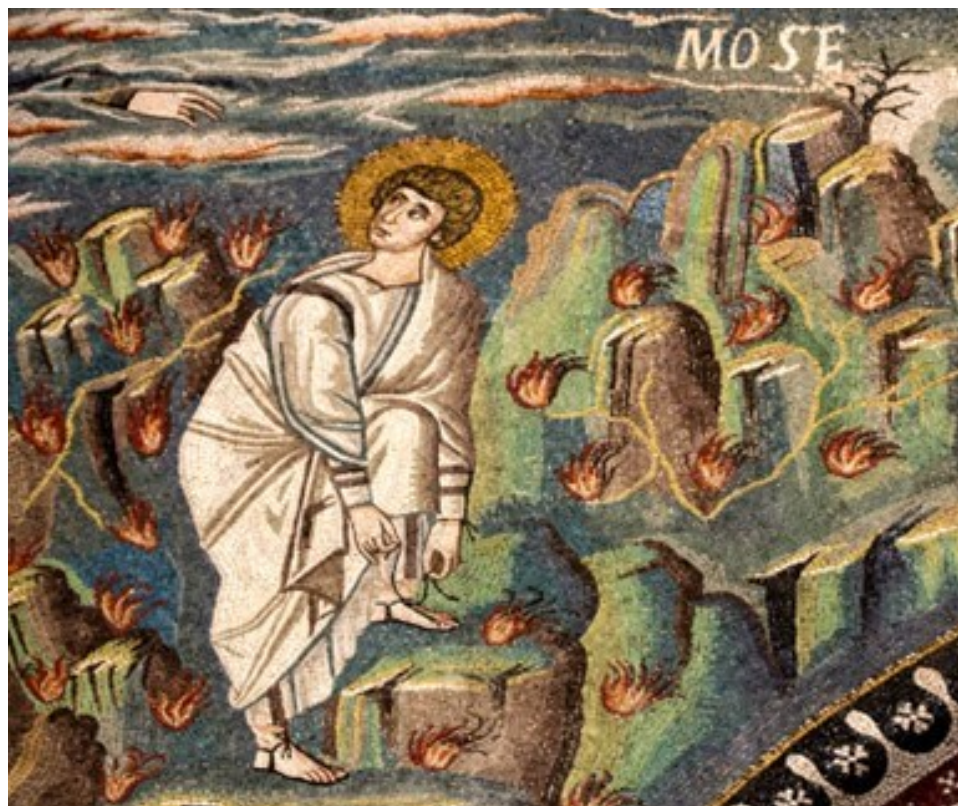
Moses Removes his Sandals before the Burning Bush, Mosaic, Church of San Vitale, Ravenna, Italy, ca. 525.