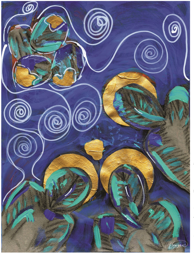
Wet Stones by Carmelle Beaugelin © Sanctified Art LLC