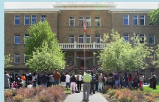
Connaught Elementary School

Thank you to all for your gifts of time, treasure and talent. Find more stories and opportunities to share gifts at www.GraceChurchCalgary.com