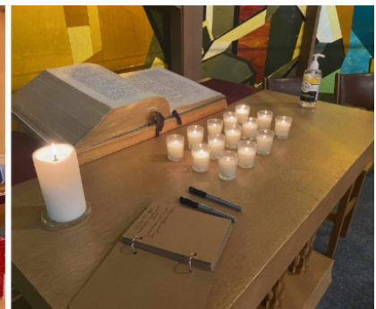
Grace Church Memorial Chapel