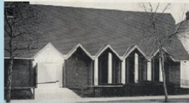
The Chapel in 1962

The Chapel has been a place for Sunday School and Children's Worship, Special Music Offerings, Evening services, and Blue Christmas celebrations for those struggling over the holidays. It holds a special place in the hearts of many people who have marked not only the special milestones of their own lives, but also of those close to them.